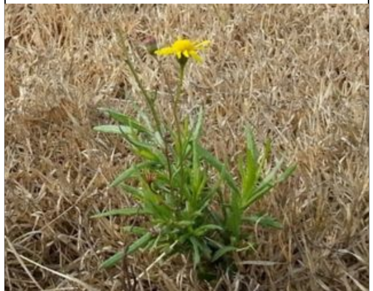
Photo: Fireweed in turf imported from Sydney to Gungahlin.

For more information, visit www.weeds.org.au/WoNS/fireweed/ or www.tams.act.gov.au .