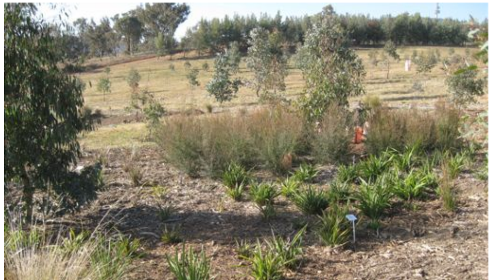
Photo: Dianella tasmanica and Leptospermum obovatum (fore to mid ground), among Eucalyptus dalrympleana planted in 2009, and with Acacia caerulescens along the ridge, looking north-east from the central garden of STEP's Forest 20 at the National Arboretum (David Shorthouse).

Seeds for the initial ground cover for the site have been donated by Warren Saunders ( Seeds and Plants Australia ). The Arboretum is responsible for mowing,