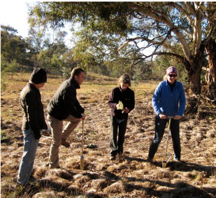
Photo: Stirling Park planting of understorey species into a patch of weedicided Chilean Needle Grass on a brisk clear morning.

The third site, at Yarramundi Reach, will be planted on Sunday 8 September (see pp.1–2).