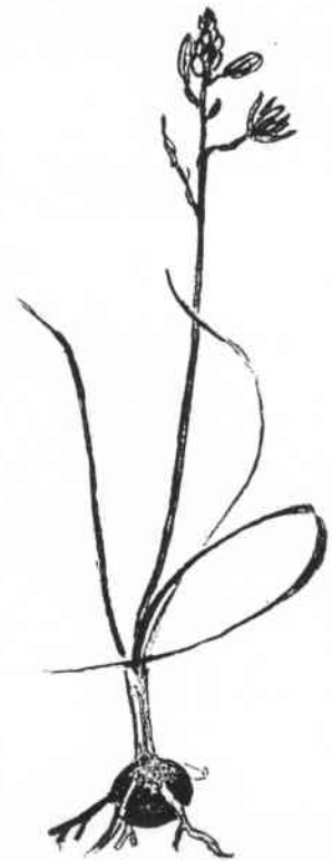
Bulbinopsis bulbosa 'Golden Lily' or 'Native Lark' Woolloomooloo September 1958

Grassland surveys are needed, especially for uncommon and threatened species, grassland invertebrate species, additional grassland sites and sites that require special protection. Long term monitoring should include the impact of management