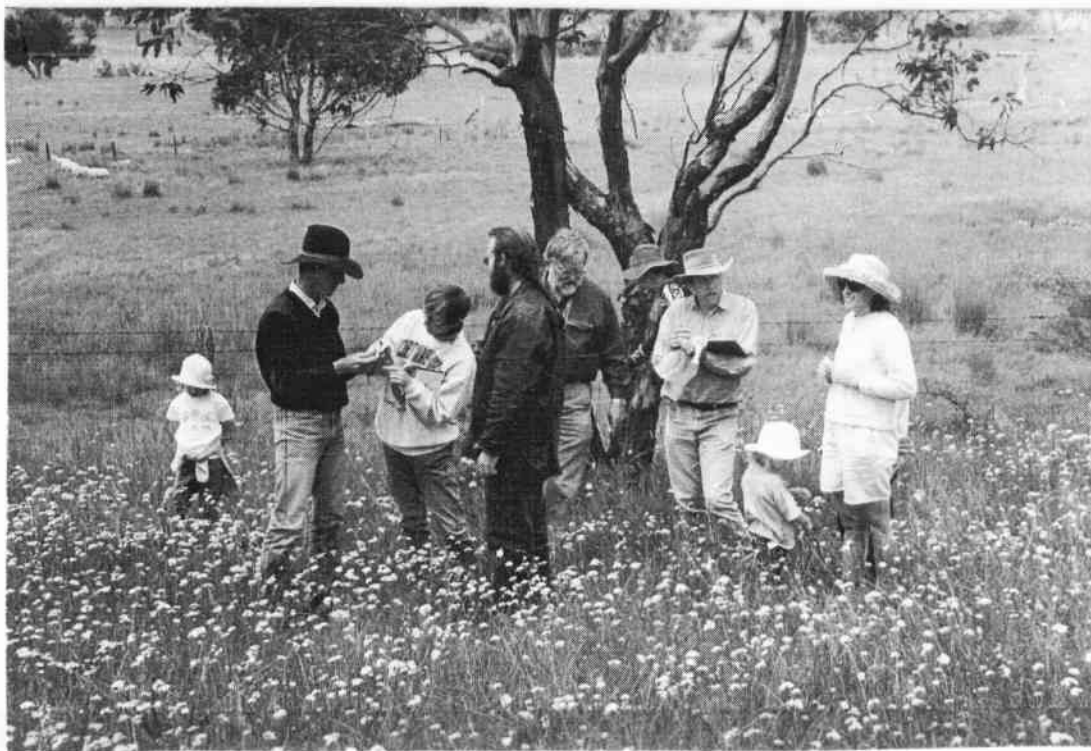
Amongst the flowers at Bigga Cemetery. We hope you get some impression of their density.

The ridges and slopes are dominated by Kangaroo Grass while the lower areas harbour more Snow-grass, Blown Grass, sedges and other moisture loving plants. A wide variety of non-grasses were also on show. A profusion of Billy Buttons ( Craspedia sp.) was beginning to seed, while the Showy Copper-wire Daisies ( Podolepis jaceoides ) were just beginning to open. There were the