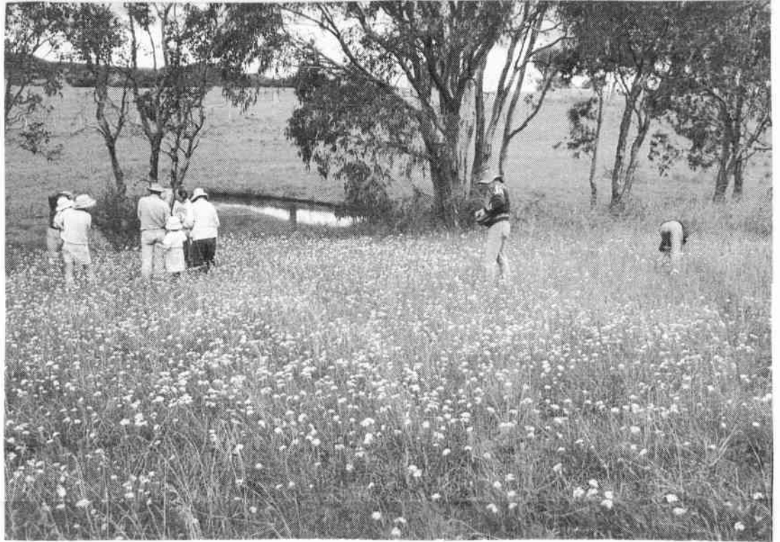
Also, Bigga Cemetery. A better photo of the mass of flowers.

area in good condition on a quiet back road within easy reach of Canberra. We parked in a delightful 'natural' clearing and within metres found ourselves among a carpet of Yass Daisies between scattered Blakely's Redgums. Pudman Creek meanders along the western boundary of the reserve, which consists of undulating creek flats of open woodland.