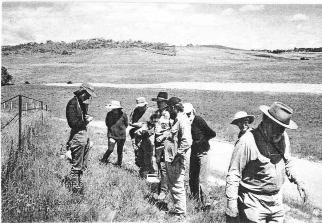
First stop a road-side verge near Adaminaby. The photo does not show the rich plant diversity.

Round Plain Cemetery was an amazing site - a church surrounded by the most stunning show of Showy Copper-wire Daisies. Vegetation was very thick at this site. The photo of this site in our last newsletter, we hope, captures some of the awe we felt. At the back of the church was the cemetery and also an area