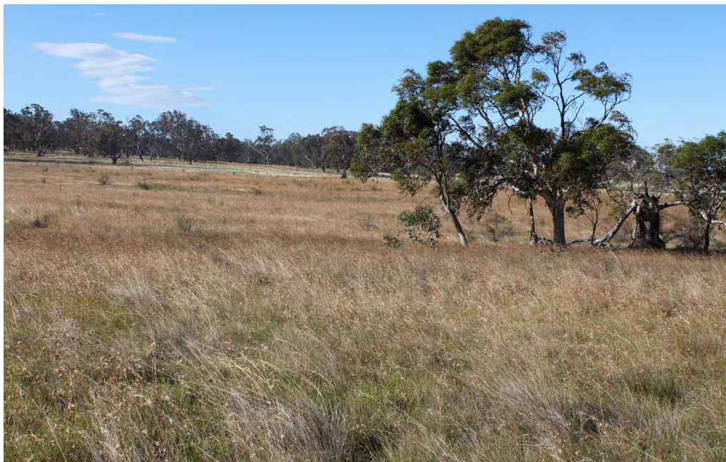
Grassland with a high floristic value score (FVS), at Gidleigh Lane Travelling Stock Reserve, Bungendore, NSW.